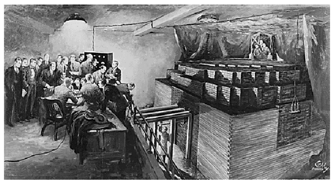
Figure 1. Artist Depiction of First Sustained Nuclear Chain Reaction by CP-1